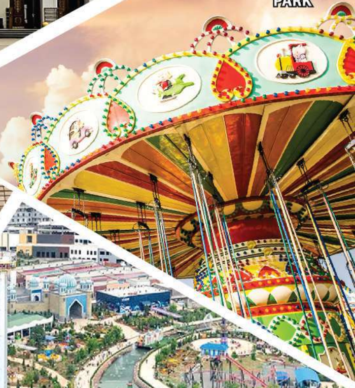
AFSONA LAND AMUSEMENT PARK